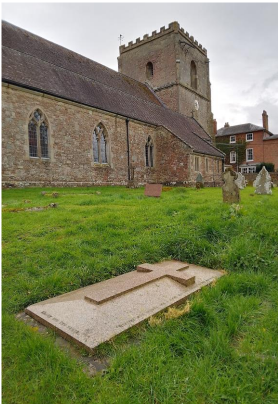
Cradley Church, Herefordshire