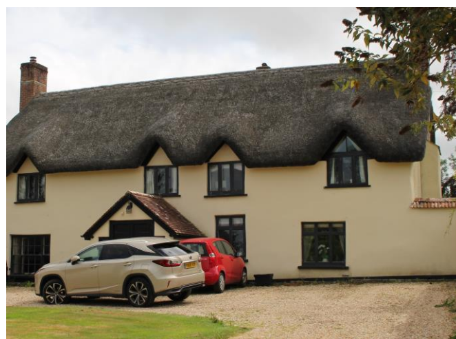
The Rectory, Cheriton Bishop