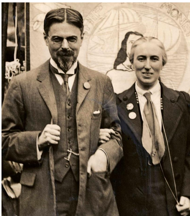
Laurence and Clemence Housman, 1911

Laurence and Clemence Housman feature heavily in an exhibition on Women's Suffrage which opened at the Hive, the home of Worcestershire Archives, in February. The compilers drew extensively on the Housman Society papers which were deposited at the Hive in 2005. A cutting from The Standard , 30 September 1911, shows Clemence with her brother posing in front of a Women's Tax Resistance League banner.