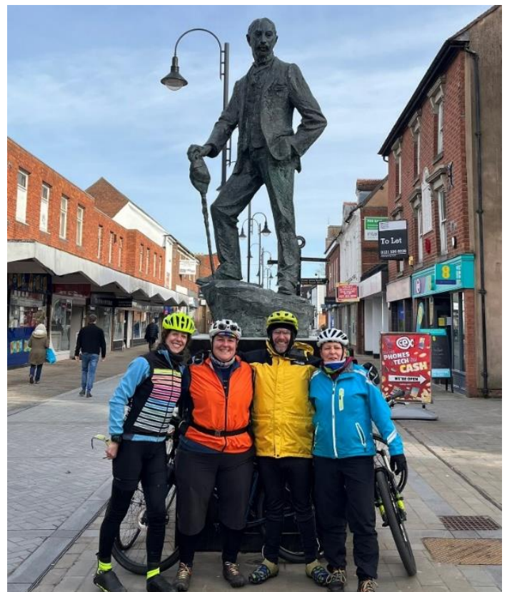
Bicycle Adventure Club members at the Housman Statue, Bromsgrove

The Birmingham-based Bicycle Adventure Club organised a cycle ride, beginning in Sanders Park, Bromsgrove, on Sunday 5 February. The ride was held during LGBT+ History Month to celebrate A.E. Housman as well as his brother and sister Laurence and Clemence. Cyclists were encouraged to wear colourful clothes and they stopped off at a few Housman places of interest during the bike ride.