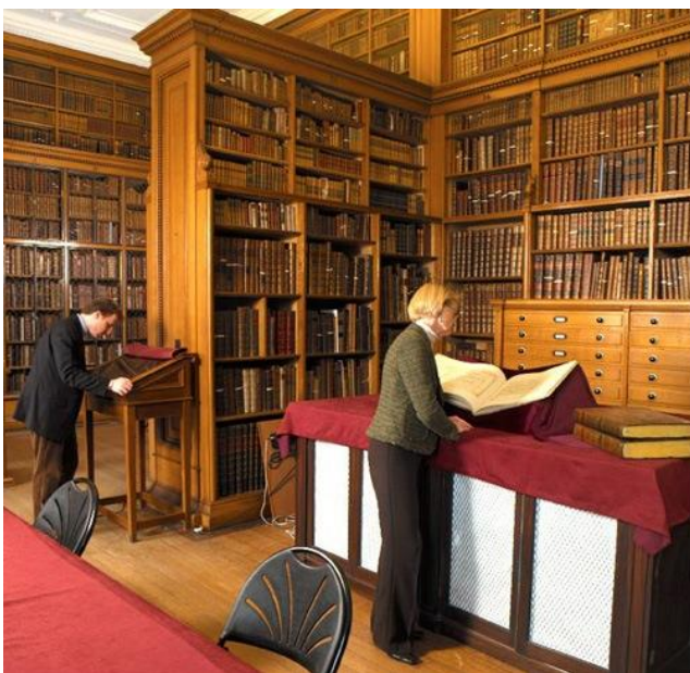
The Founders Library, Fitzwilliam Museum