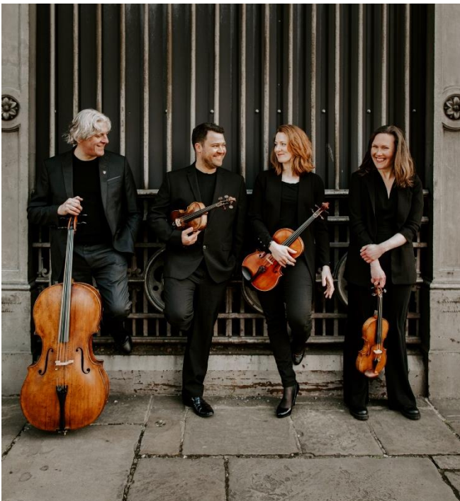
The Dante Quartet