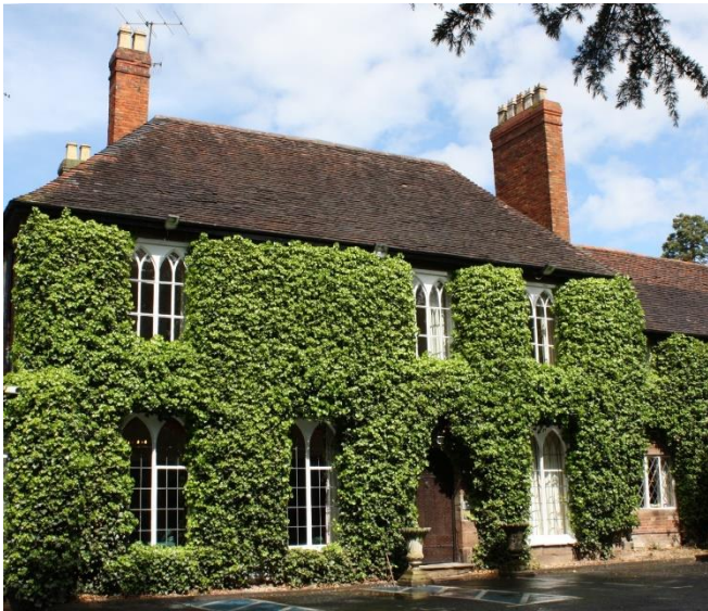
Perry Hall, Bromsgrove