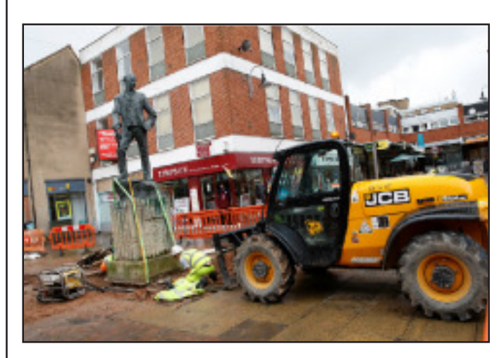
As part of the scheme to regenerate Bromsgrove High Street the Housman statue was moved from its position to a more central location. Details of the move will be featured in the February Newsletter

Published by The Housman Society, 80 New Road, Bromsgrove. The next Newsletter will be circulated in February 2015 and contributions should be sent to the Editor at the address given on page 1 by 1st February 2015.